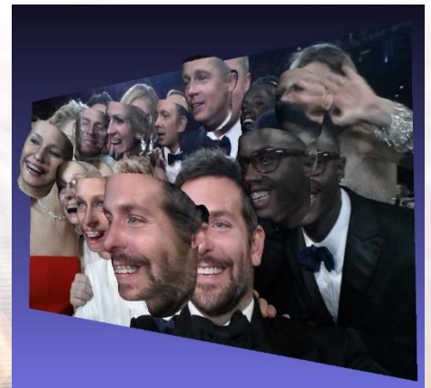
3D Face Reconstruction